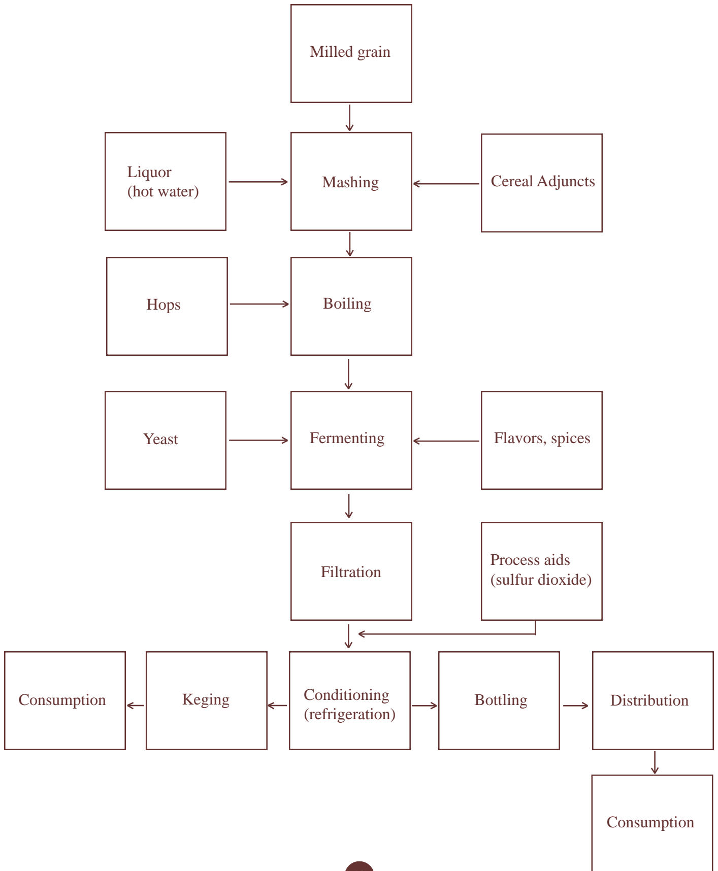
Figure 1. General Flow Diagram of a Brewing Process