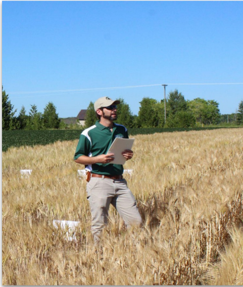
Research Grant Program