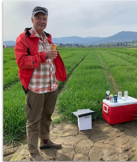
Quality Evaluation Program