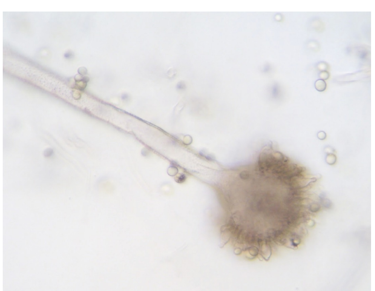
Figure 1. Images of Koji (clockwise from top left) Koji mycelium grown on rice. Koji conidiophore (spore-bearing structure) under the microscope at 400x.