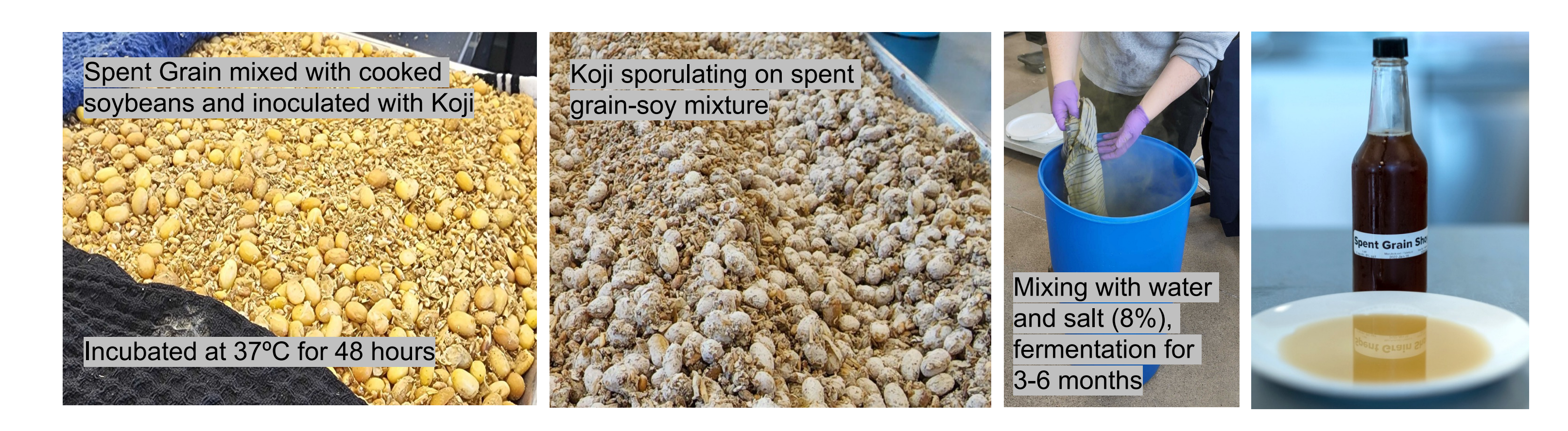
Figure 3. Overview of process for producing spent grain shoyu by inoculating spent grain and soybeans with koji.