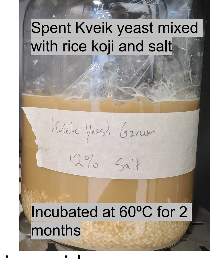
Figure 5. Measurement of amino acid concentration of yeast slurry and an overview of the Yeast Garum production process.